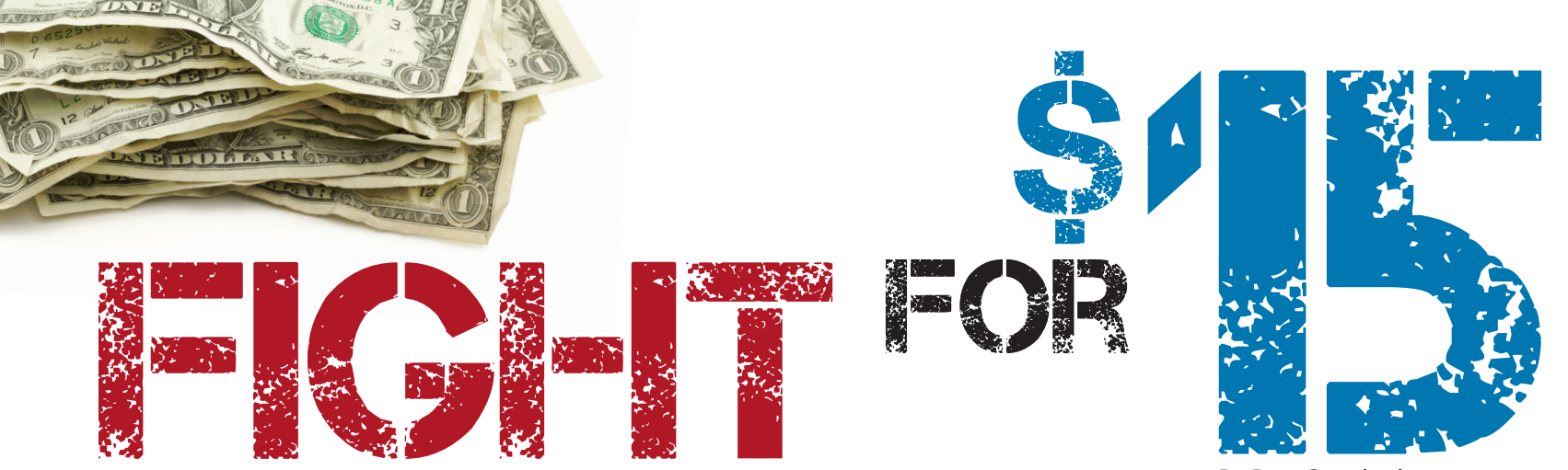
By Dan Cunningham

In 2012 and again in 2013, when scores of New York City fast-food workers walked off job sites, most political pundits and economic gurus dismissed their $15-per-hourwage demand as "tilting at windmills." Corporate powers shrugged and Wall Street yawned. They wagered the cause would just fade away.